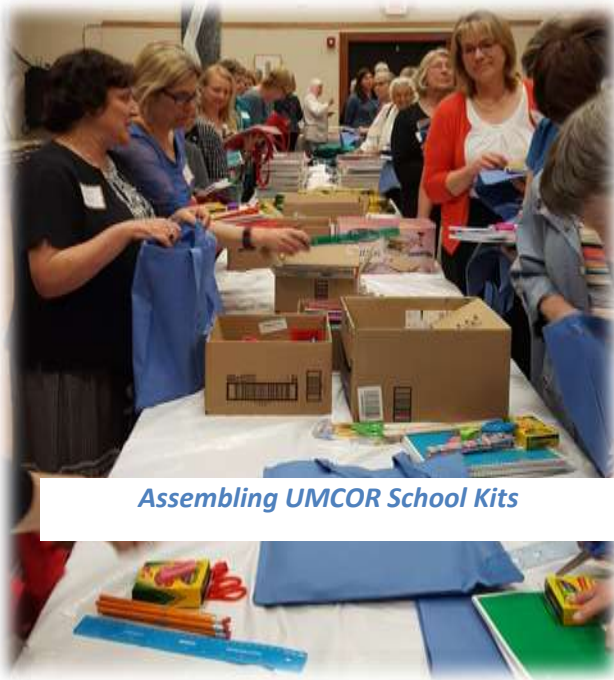
Assembling UMCOR School Kits

On Tuesday evening, May 16, more than seventy-five people gathered at Temple Israel of Northern Westchester (TINW) in Croton-on-Hudson for a program focusing on plight of refugee women and families.